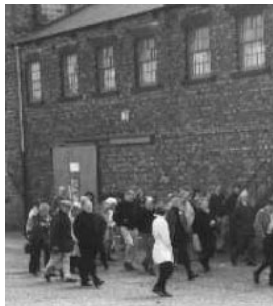
At the last collectors' day, members walk beneath the windows of the g