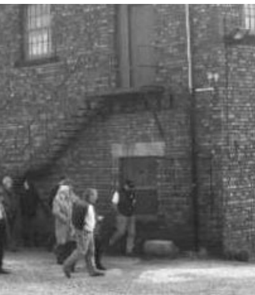
ilding, lustring and engraving shops, recognisable in the photos below.

my freind has a two handled dish with mailing 1762 newcastle on tyne marked on it it has ben damaged and glued back together would it still be of eny value No, but a couple of hours with a dictionary and a book on English grammar and punctuation might be.