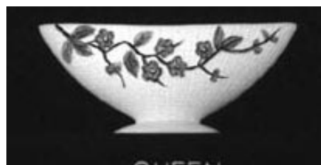
Above: an example of Maling's “Cherry Blossom” range. Below: the mould rediscovered after almost forty years.