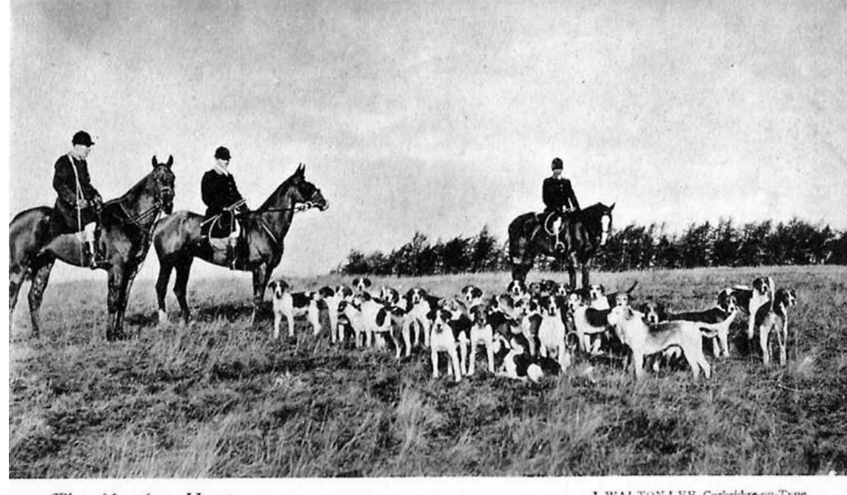
The Haydon Hunt.

Pottery with hunting scenes had been produced at the factory since the 19th century, but it is the 20th century fox's head stirrup cup (known to the workers as the fox horn stirrup cup) and the matching